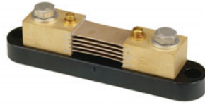
← HA Type